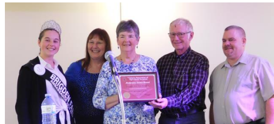
Brigden Fire Department accepted the Parade Marshall Award.