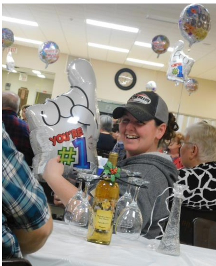
Successful bucket draws were held.