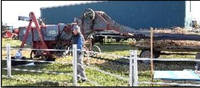
View farm machinery of the past