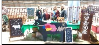
Learn where your food comes from

Opportunity for families to come & learn together at our hands-on learning centers.